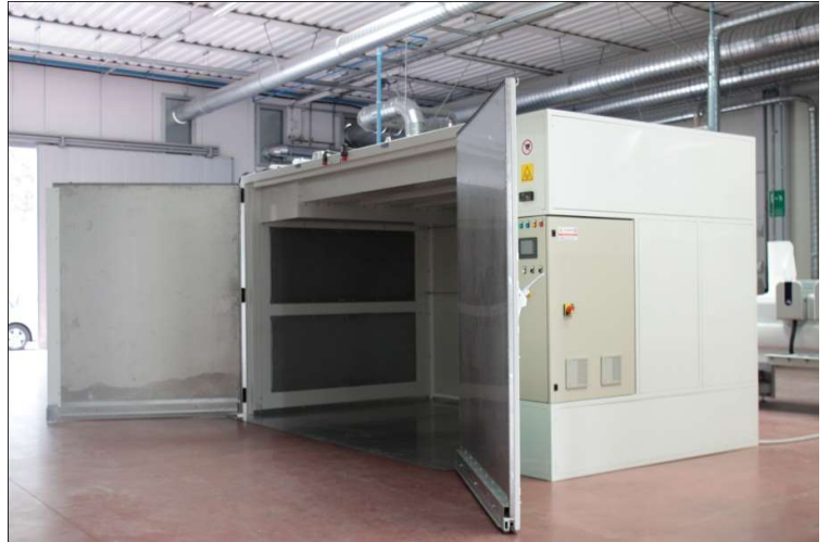
MTT with manual doors, equipped for woodworm treatment