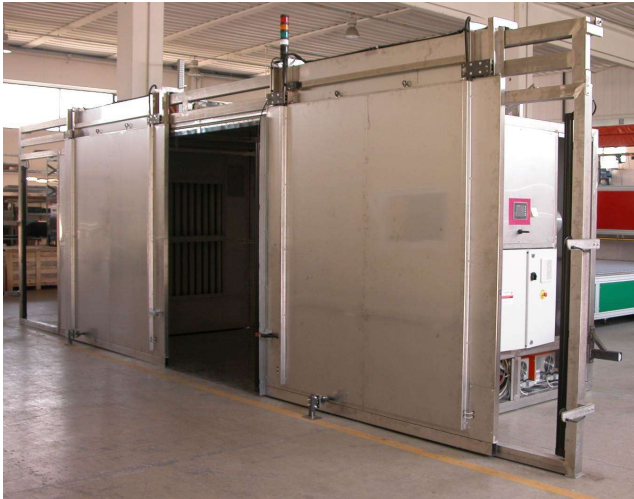
MTT with slide doors for food treatment

MULTIFUNCTIONAL SPACIOUS FURNACE WITH ALL-IN-ONE BUILT-IN MICROWAVES, INFRARED (IR) AND HOT AIR TECHNOLOGY