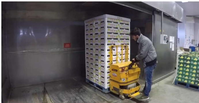
Ideal solution for automatic storage