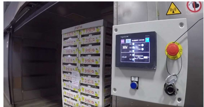
Multilanguage panel, with remote control (i.e. radio command)