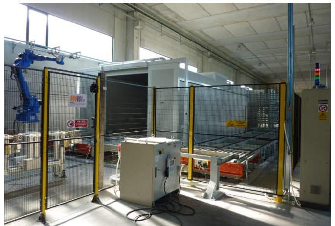
Automatic MTT for robot production in special industrial treatment