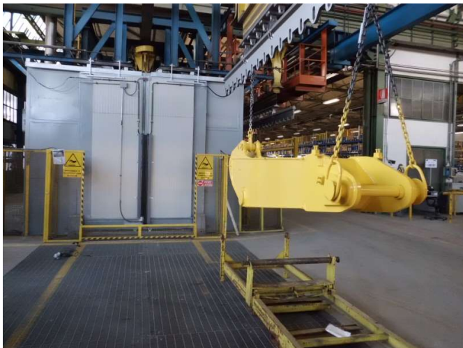
MTT in automatic cycle for varnish polymerization in metal manufacture (automotive sector).