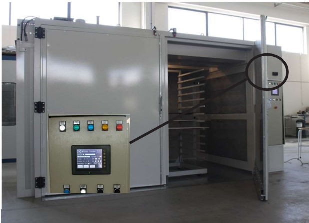
Control panel with touch screen