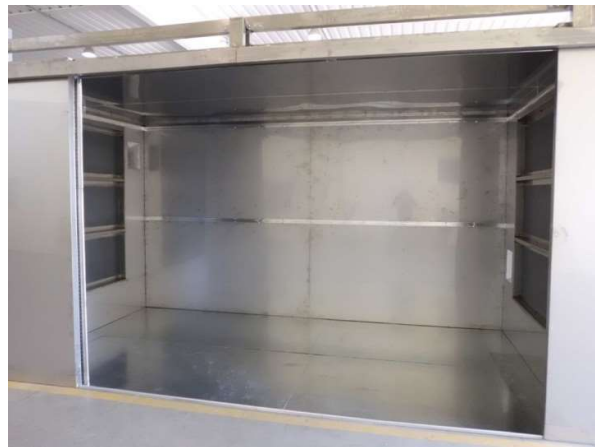
Spacious multipurpose treatment chamber