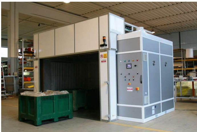
MTT with slide doors for pet food treatment