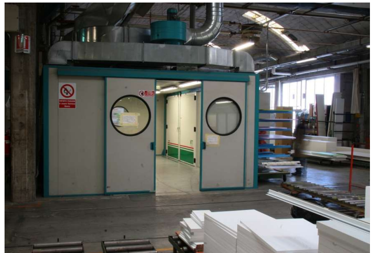
MTT installed into a cleaning room for special and just in time production in furniture.